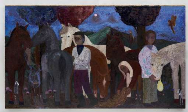
Long Ago, Body Image: Horses Greeting the Morning and Three People