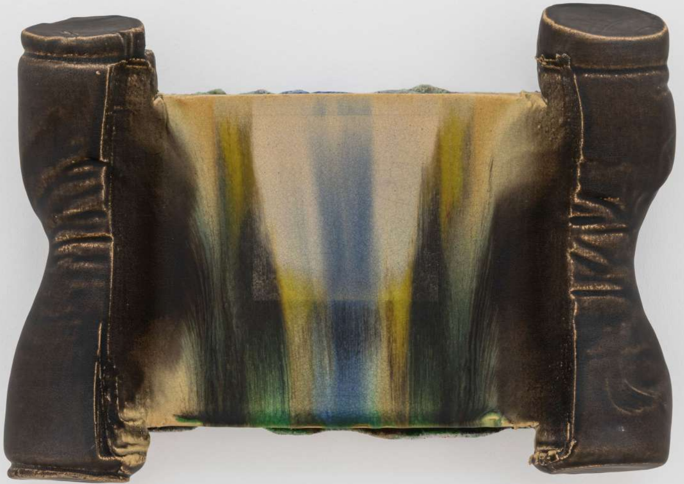
Cricket footwork, 2026. Glazed Ceramic 12 x 17 1/2 x 6 in (30.5 x 44.5 x 15.2 cm)