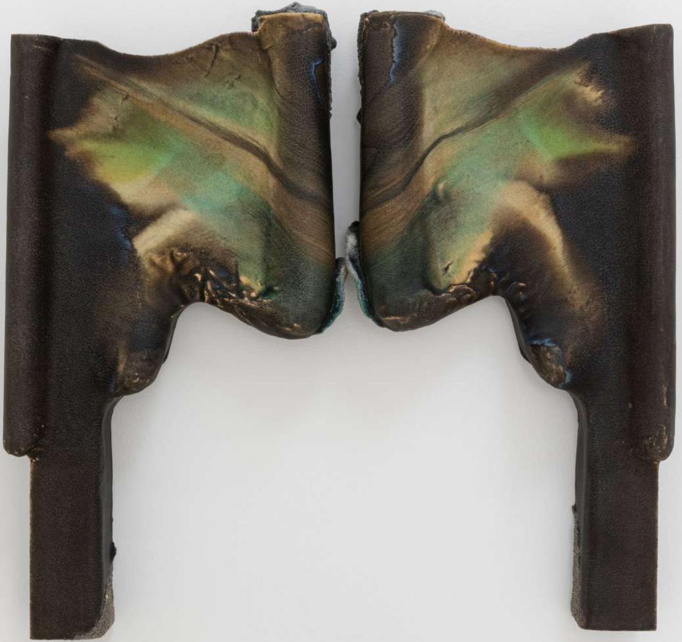
Sun wife , 2026. Glazed Ceramic 20 x 22 x 3 1/2 in (50.8 x 55.9 x 8.9 cm)