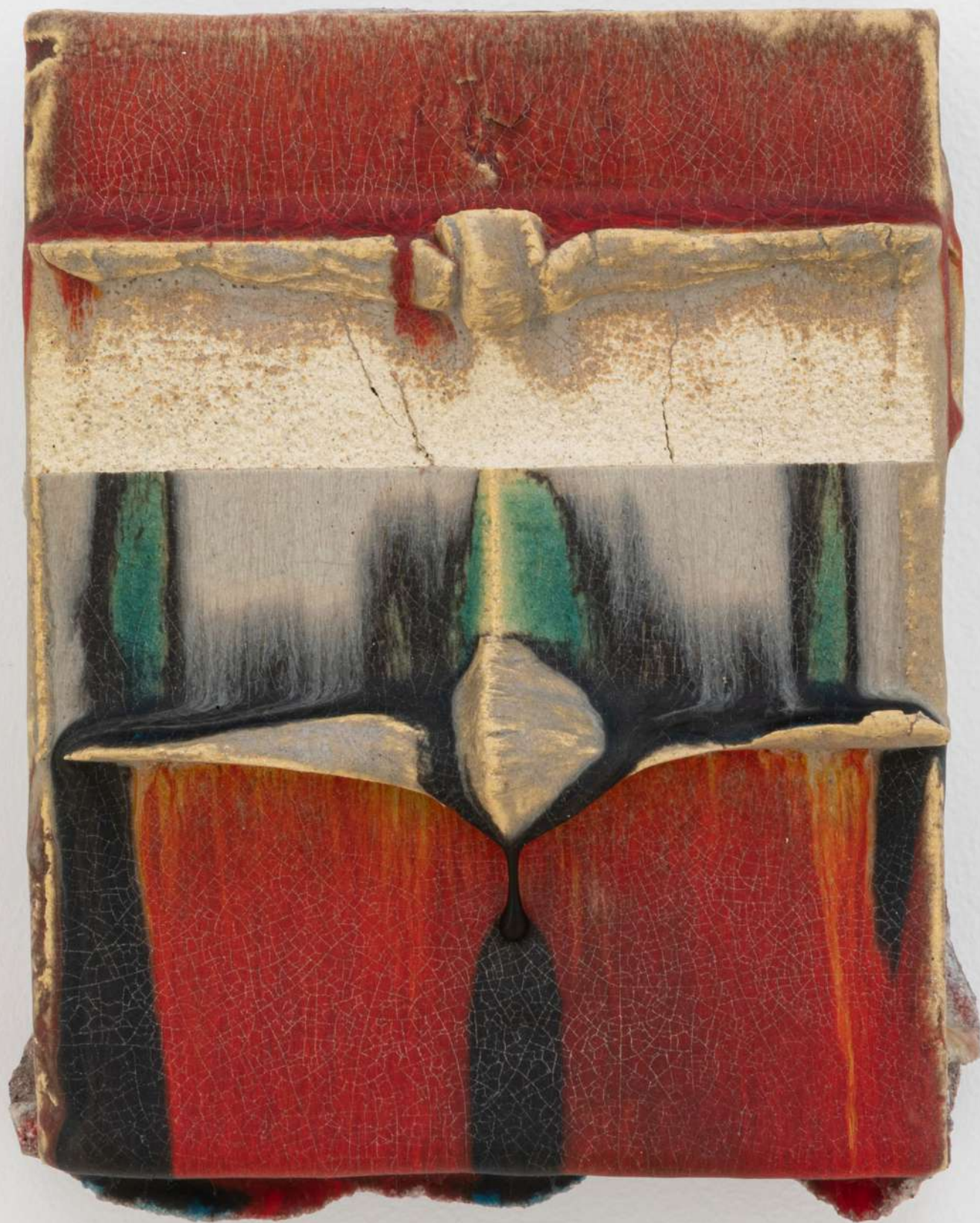
Poets for nothing , 2026. Glazed Ceramic 9 x 7 x 3 1/2 in (22.9 x 17.8 x 8.9 cm)