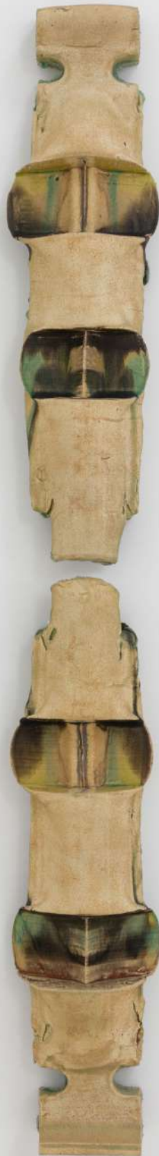
Cooli cooli , 2026. Glazed Ceramic 60 x 8 x 4 in (152.4 x 20.3 x 10.2 cm)