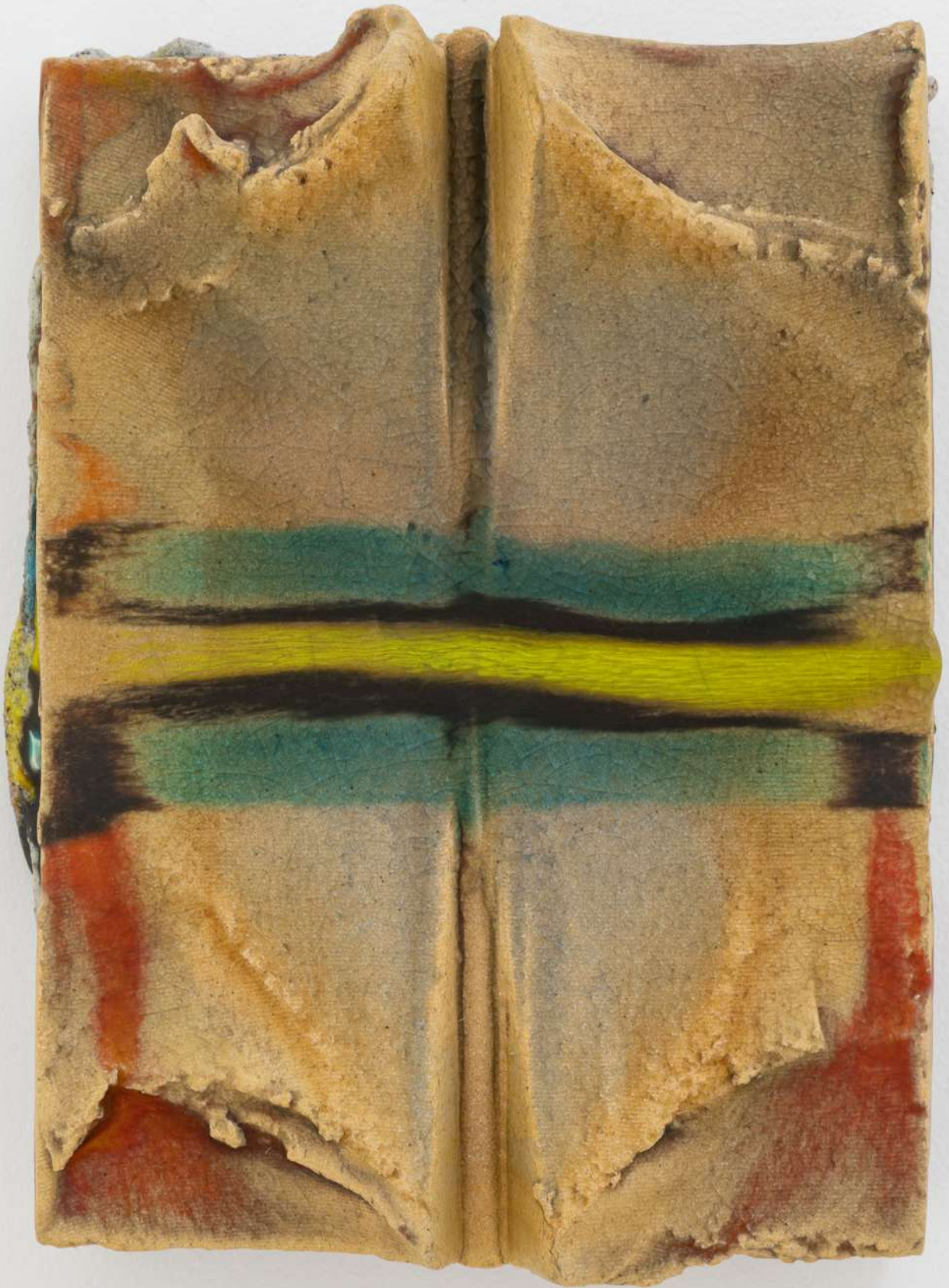
Couvade , 2026. Glazed Ceramic 10 1/2 x 7 1/2 x 3 in (26.7 x 19.1 x 7.6 cm)