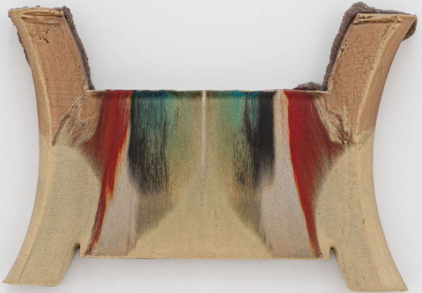
Penny-ante , 2026. Glazed Ceramic 21 1/2 x 15 x 3 in (54.6 x 38.1 x 7.6 cm)