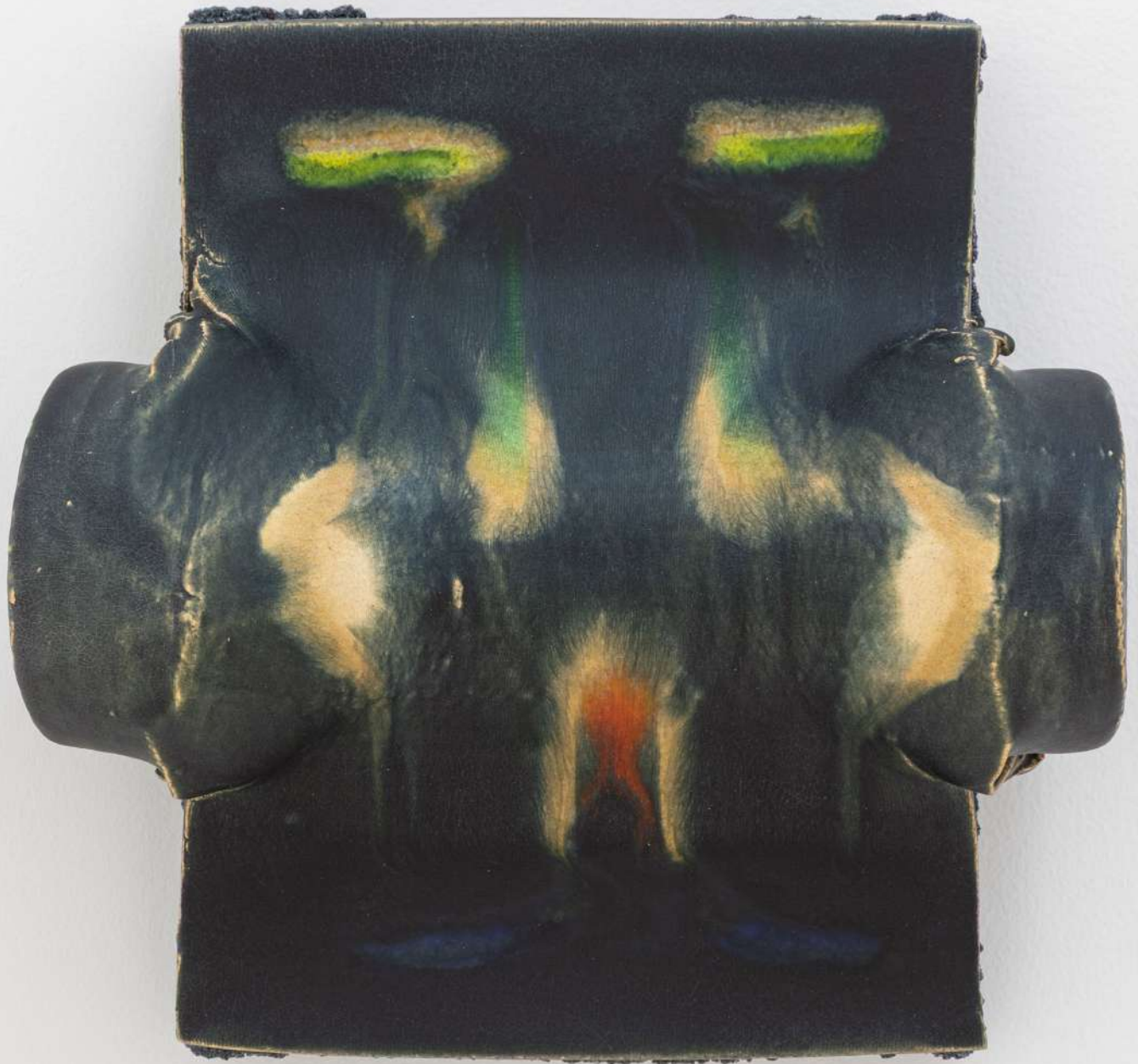
Lurk & Pearce, 2026. Glazed Ceramic 11 x 10 1/2 x 4 1/2 in (27.9 x 26.7 x 11.4 cm)