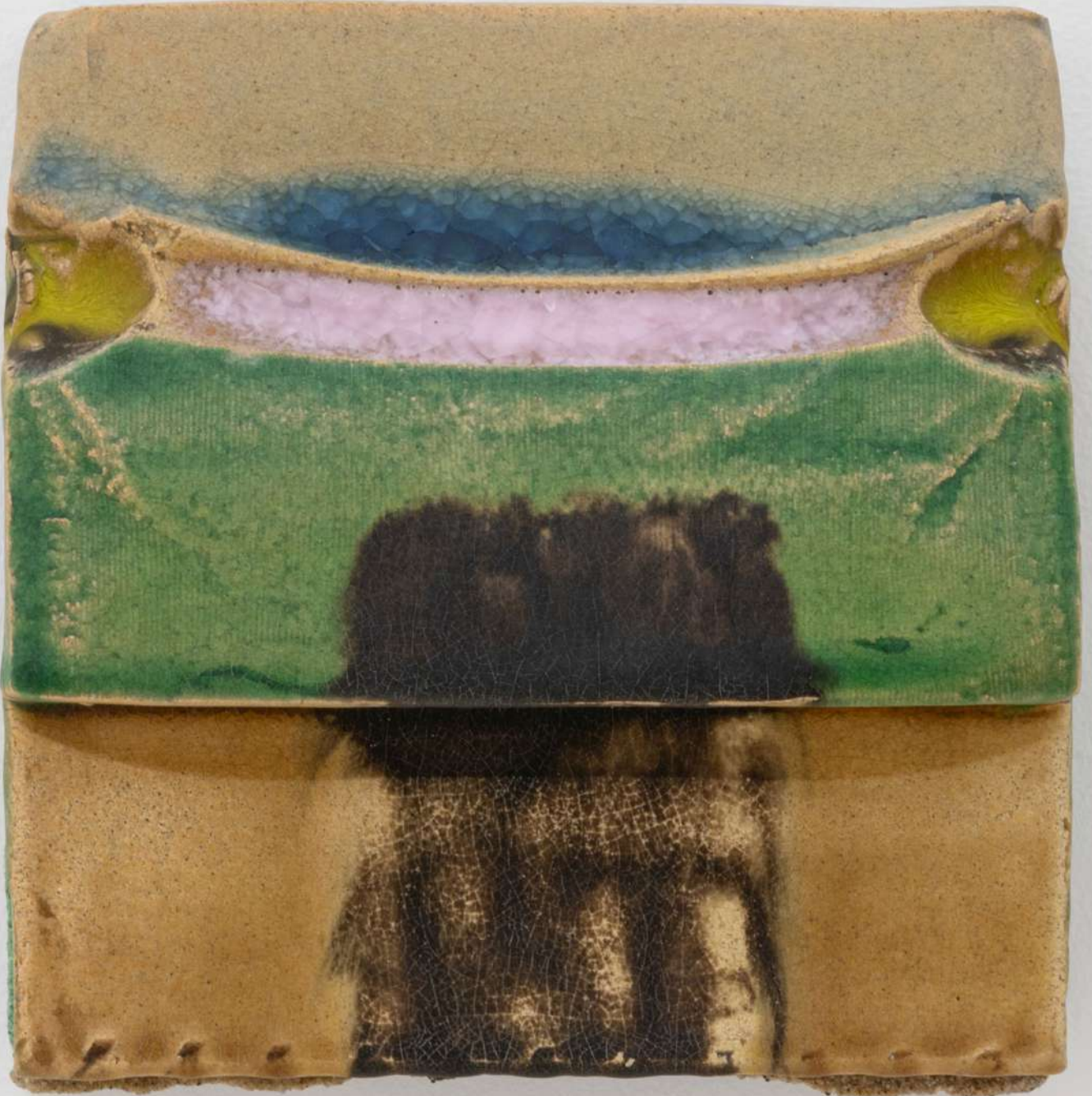
Habités , 2026. Glazed Ceramic 7 x 7 1/2 x 3 1/2 in (17.8 x 19.1 x 8.9 cm)