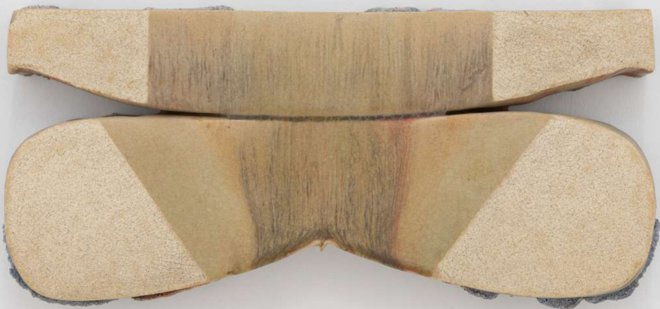
Soaking the chain , 2026. Glazed Ceramic 8 x 17 x 3 in (20.3 x 43.2 x 7.6 cm)