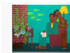
Amel Bashier Home 1 , 2026 Acrylic and ink on canvas 76¾ x 63 in. 195.00 x 160.00 cm