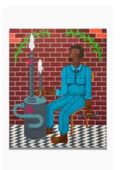
Amel Bashier Factory Woman , 2026 Acrylic and ink on canvas 63 x 51⅝ in. 160.00 x 130.00 cm