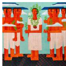
Amel Bashier Ward El Juri , 2024 Acrylic and ink on canvas 76¾ x 76¾ in. 195 x 195 cm