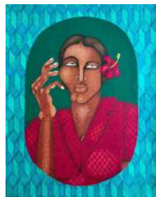
Amel Bashier Untitled , 2026 Ink on paper 25⅝ x 19¾ in. 65.00 x 50.00 cm