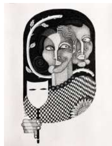
Amel Bashier Mask , 2026 Ink on paper 25⅝ x 19¾ in. 65.00 x 50.00 cm