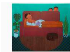
Amel Bashier Home 3 , 2026 Acrylic and ink on canvas 76¾ x 63 in. 195.00 x 160.00 cm