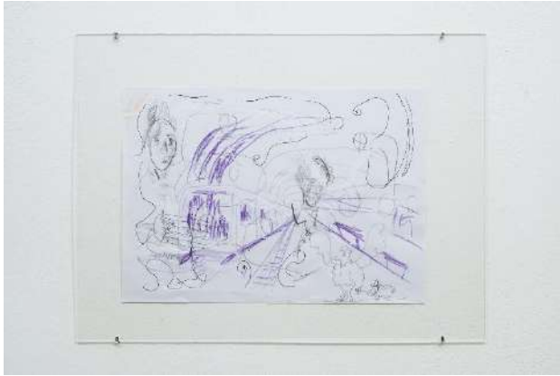
Title Cornellia Scheffer-Lamme is great, idem Ary/Arij Scheffer Material: graphite, colour pencil, ink, printing paper, Plexiglass, telefoonduin nails Size 30 x 40 cm (incl. Plexiglass) Year 2026 Map number 3