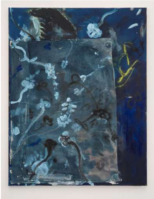
Title Double Bloomed Material Acrylics, pigment, acrylic binder, charcoal, black gesso, gouache, varnish on cotton on cotton Size 130 x 100 cm Year 2026 Map number 27