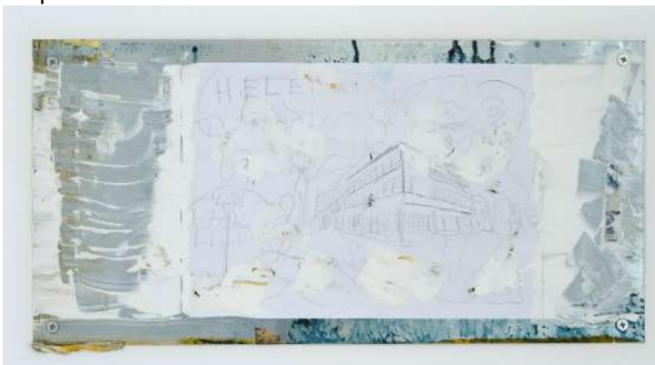
Title De Helena Material: Metal (Alu), acrylic, printing paper, graphite, screws, varnish, pigment paint, acrylics, tape Size 25 x 50 cm Year 2026 Map number 12