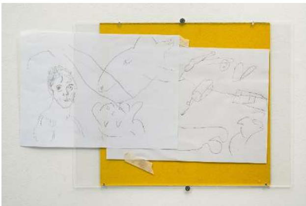
Title From the Sky to the Ground