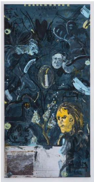
Title Material Metal plate, screws, photo transfer, acrylics, pigment, acrylic binder, charcoal, black gesso, gouache, varnish on cotton Size 140 x 70 cm Year 2024 Map number 28