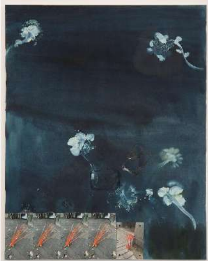
Title I hope this email finds you well Material Dibond, pigment, acrylic binder, gouache screws, varnish on cotton Size 140 x110 cm Year 2026 Map number 17