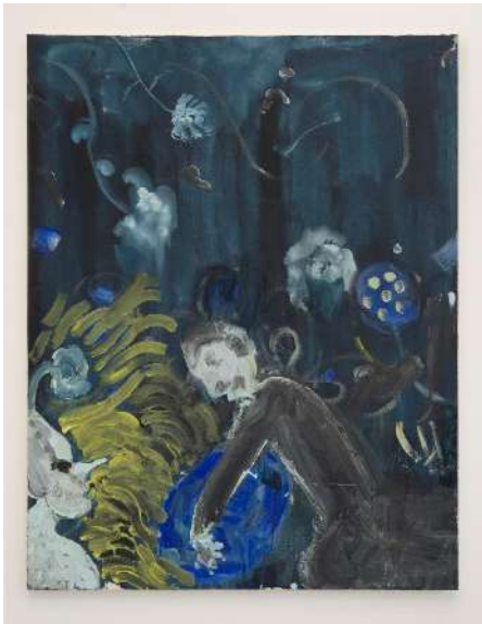
Title Omarmrijkelijke TweeKijks Material: Pigment, acrylic binder, charcoal, black gesso, gouache, acrylics, crayon, varnish on cotton Size 130 x 100 cm Year 2026 Map number 16