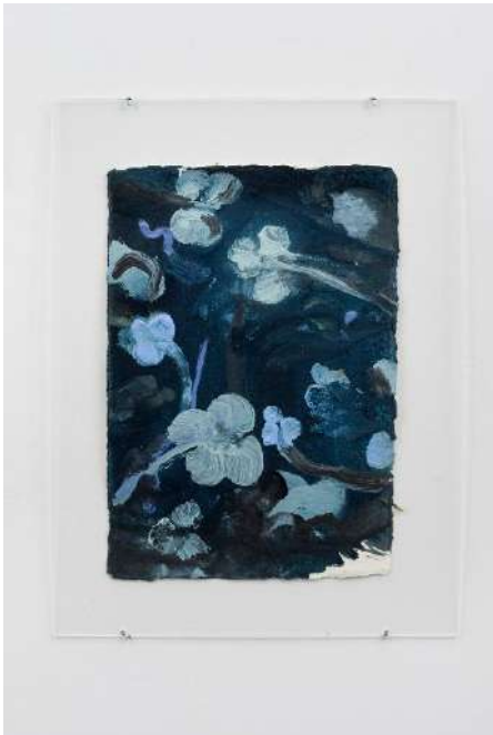
Title Bloemen tekening Material 320 gsm paper, gouache, black gesso, pigment and acrylic binder, charcoal, acrylics, varnish, plexiglass, telefoondruim nails Size 40 x 30 cm (incl. Plexiglass) Year 2026 Map number 22