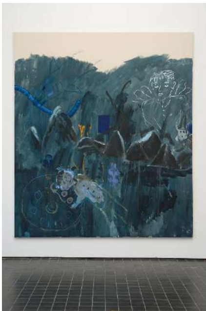
Title Between the Mountains Lays the Fiberglass Hug Material Pigment, acrylic binder, black gesso, tempera, acrylics, charcoal, varnish on cotton Size 230 x 200 cm Year 2026 Map number 18