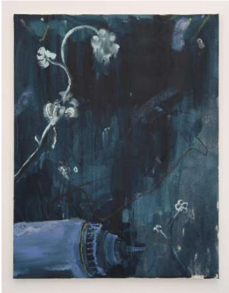
Title Deepsea Submarine Communication cable (Blooming Information) Material: Pigment, acrylic binder, charcoal, gouache, acrylics, crayon, varnish on cotton Size 130 x 100 cm Year 2026 Map number 15