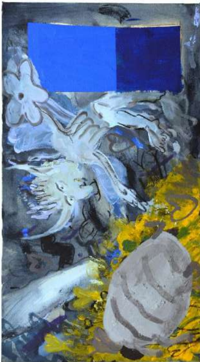
Title Crawler Material Acrylics, pigment, acrylic binder, charcoal, black gesso, gouache, varnish on cotton Size 90 x 50 cm Year 2026 Map number 26