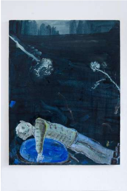
Title Encounter (Most paintings are made with pigment paint) Material: pigment, acrylic binder, gouache, acrylics, black gesso, charcoal, varnish on cotton Size 130 x 100 cm Year 2026 Map number 11