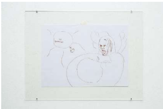
Title Schaal in plek (Clone Drawing Series) Material: Colour pencil, tape, printing paper, Plexiglass, telefoonduin nails Size 30 x 40 cm (incl. Plexiglass) Year 2026 Map number 5