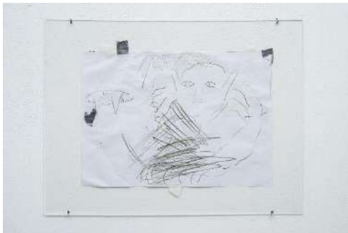
Title Hoekkijkende vampieren tand verwarring Material: graphite, tape, printing paper, Plexiglass, telefoonduin nails Size 30 x 40 cm (incl. Plexiglass) Year 2026 Map number 4