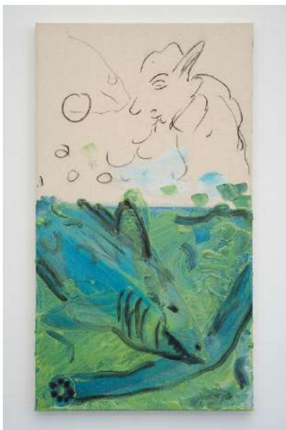
Title Shark bite 1 Material Acrylics, pigment and acrylic binder, black gesso, charcoal, varnish, on cotton Size 90 x 50 cm Year 2026 Map number 24