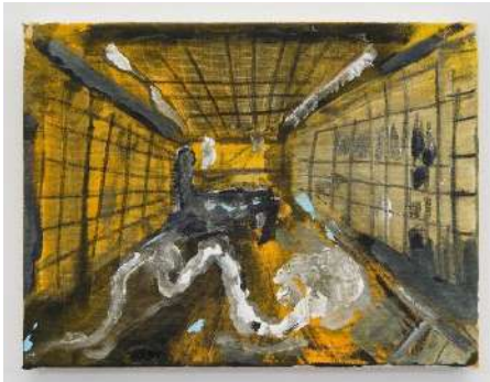
Title Endless information (mixture of Billyt-Spaces), shelving, minds and round table meeting Material: Gouache, black gesso, pigment, acrylic binder, acrylics, charcoal, varnish on cotton Size 30 x 40 cm Year 2026 Map number 7