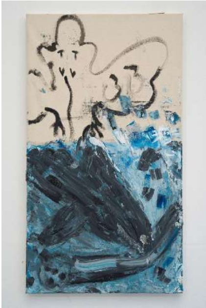
Title Shark bumping into something (for the shark) new 1 Material Acrylics, tape, pigment and acrylic binder, black gesso, varnish, on cotton Size 90 x 50 cm Year 2026 Map number 25