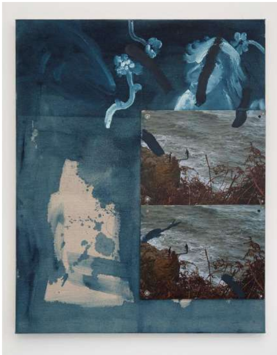
Title Submerge Material: Dibond, linen, pigment, acrylic binder, screws and attachments, gouache, varnish on linnen Size 100 x 80 Year 2026 Map number 14