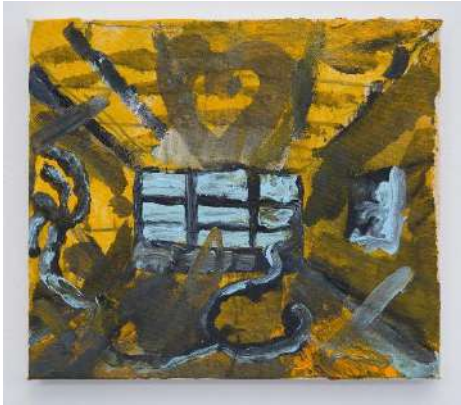
Title Billytown Atelier Portray Material: Gouache, black gesso, pigment, acrylic binder, acrylics, charcoal, varnish on cotton Size 35 x 40 cm Year 2026 Map number 6