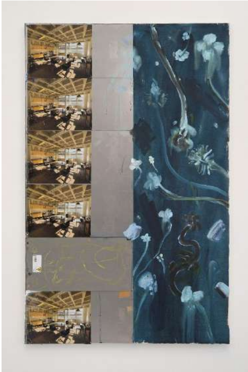
Title Community Practice Material steel plates, stickers, crayon, pigment, acrylic binder, black gesso, gouache, varnish, screws on cotton Size 150 x 95 cm Year 2026 Map number 21