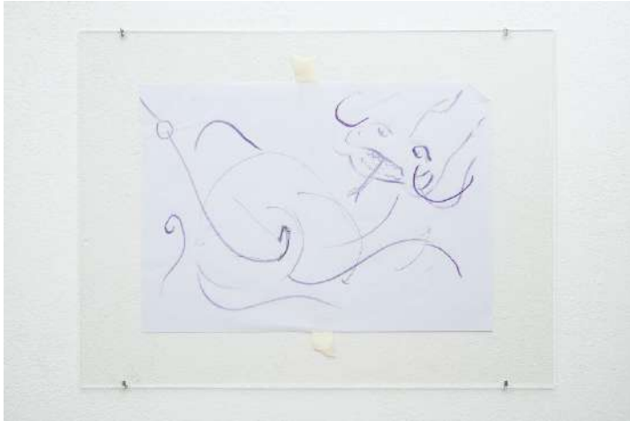
Title Catfish (Drawing Behind Plexiglass Series) Material: printing paper, colour pencil, plexiglass, telefoonduin nails, Size 30 x 40 cm (incl. Plexiglass) Year 2026 Map number 13