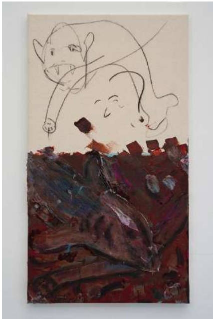
Title Sharking Nibble 1 Material Acrylics, pigment and acrylic binder, black gesso, charcoal, varnish, on cotton Size 90 x 50 cm Year 2026 Map number 23