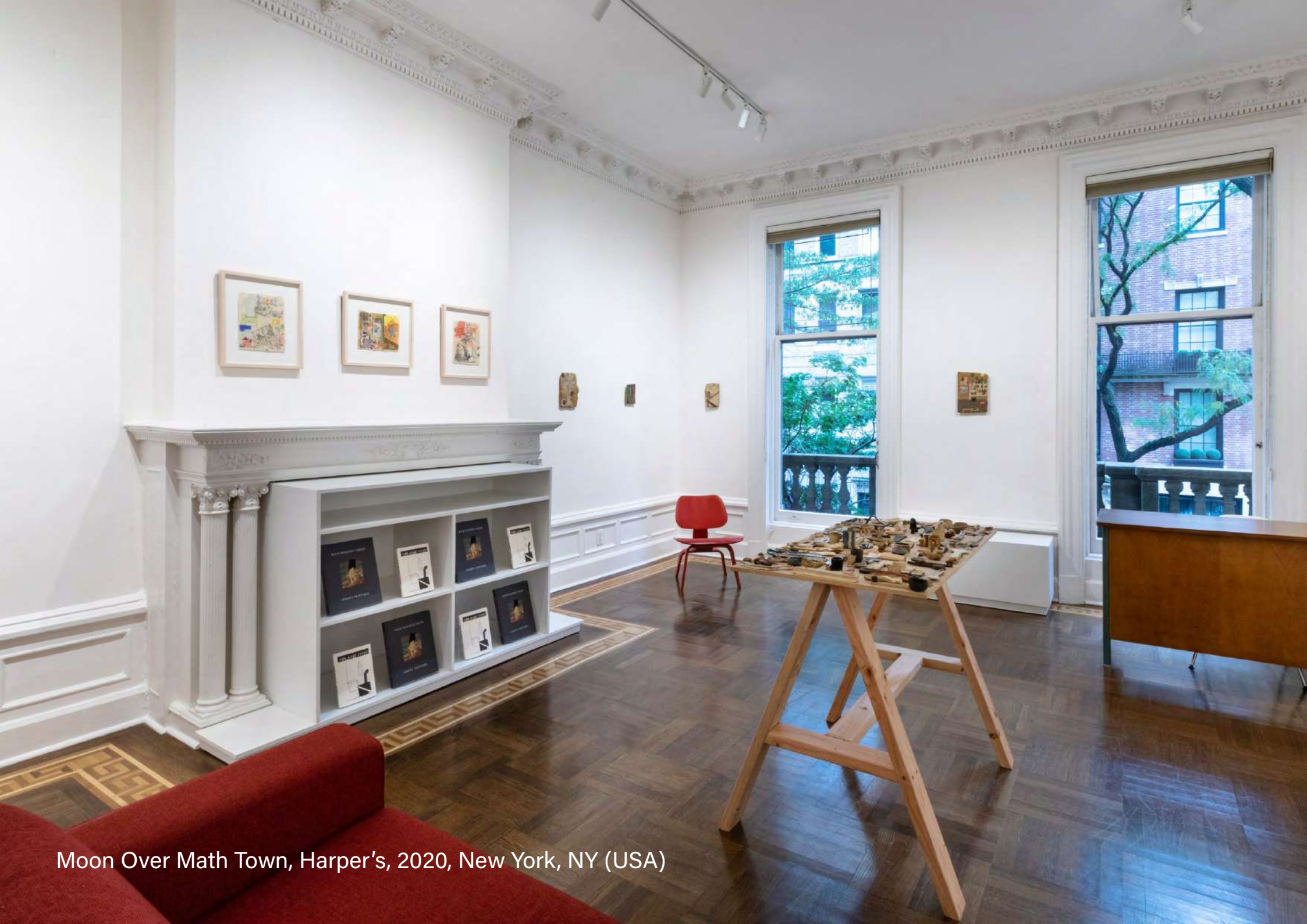
Moon Over Math Town, Harper's, 2020, New York, NY (USA)