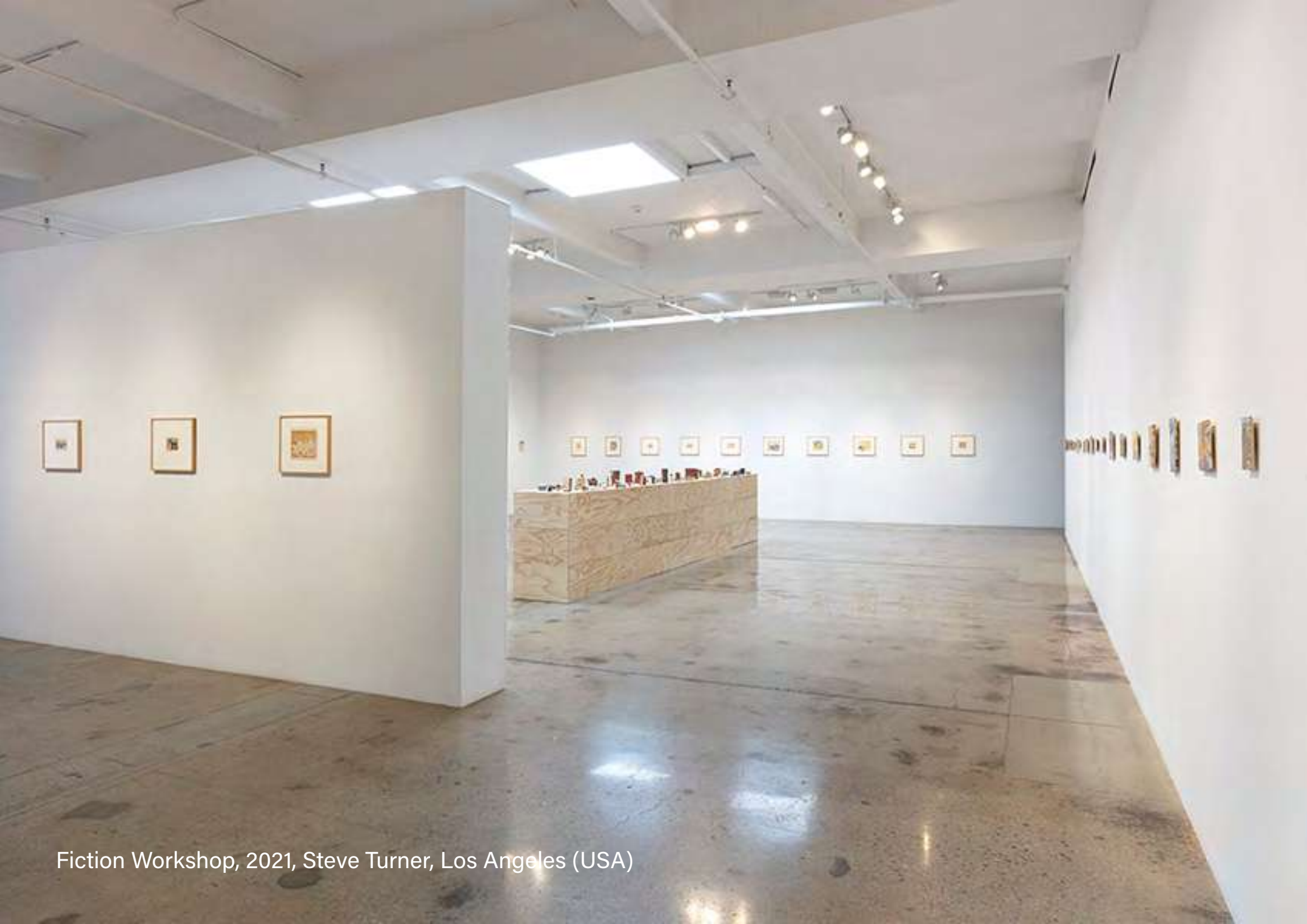
Fiction Workshop, 2021, Steve Turner, Los Angeles (USA)