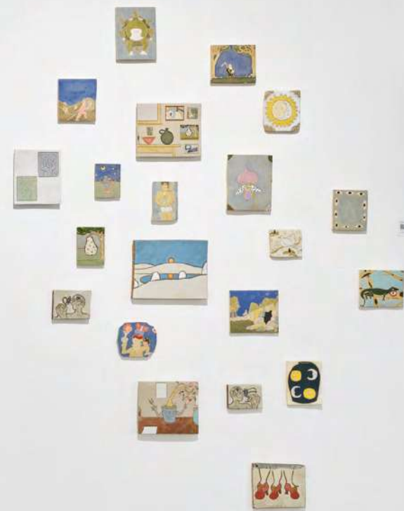
Art Antwerp 2025, 2025, Antwerp (BE)