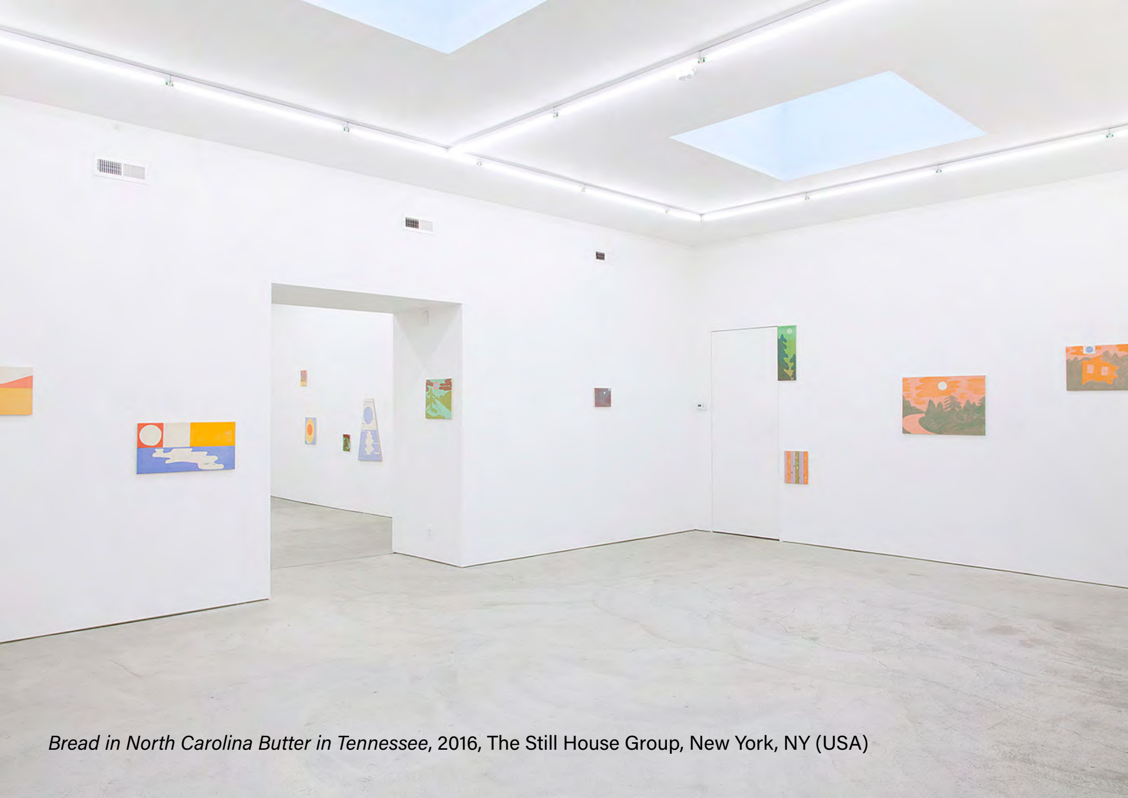
Bread in North Carolina Butter in Tennessee, 2016, The Still House Group, New York, NY (USA)