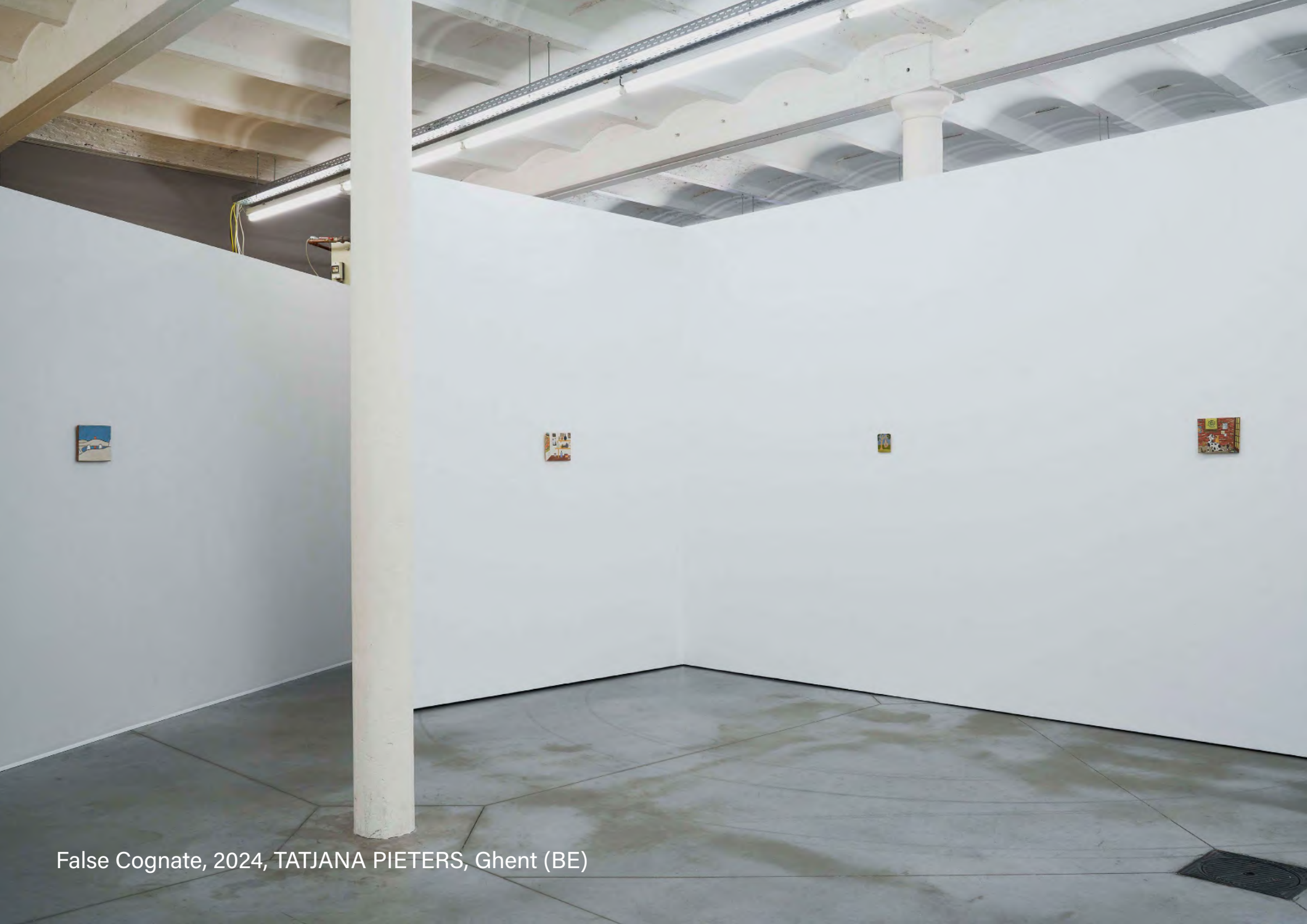
False Cognate, 2024, TATJANA PIETERS, Ghent (BE)