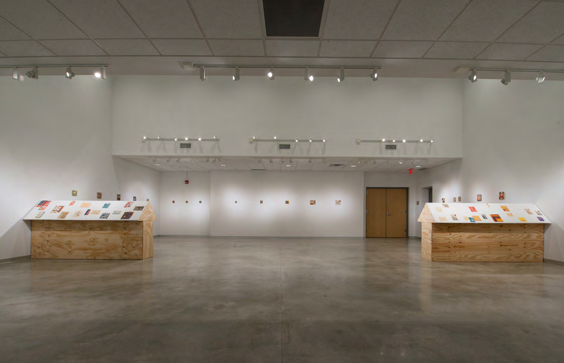
When the World's On Fire, 2023, Institute of Contemporary Art, Chattanooga, TN (USA)