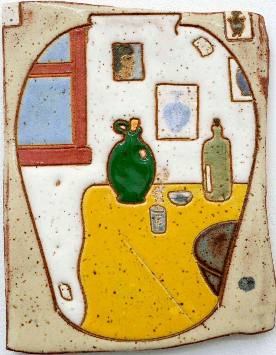
Table Corner (Yellow Tablecloth Red Window), 2023

Geglazuurde keramiek 17,8 cm x14 cm uniek