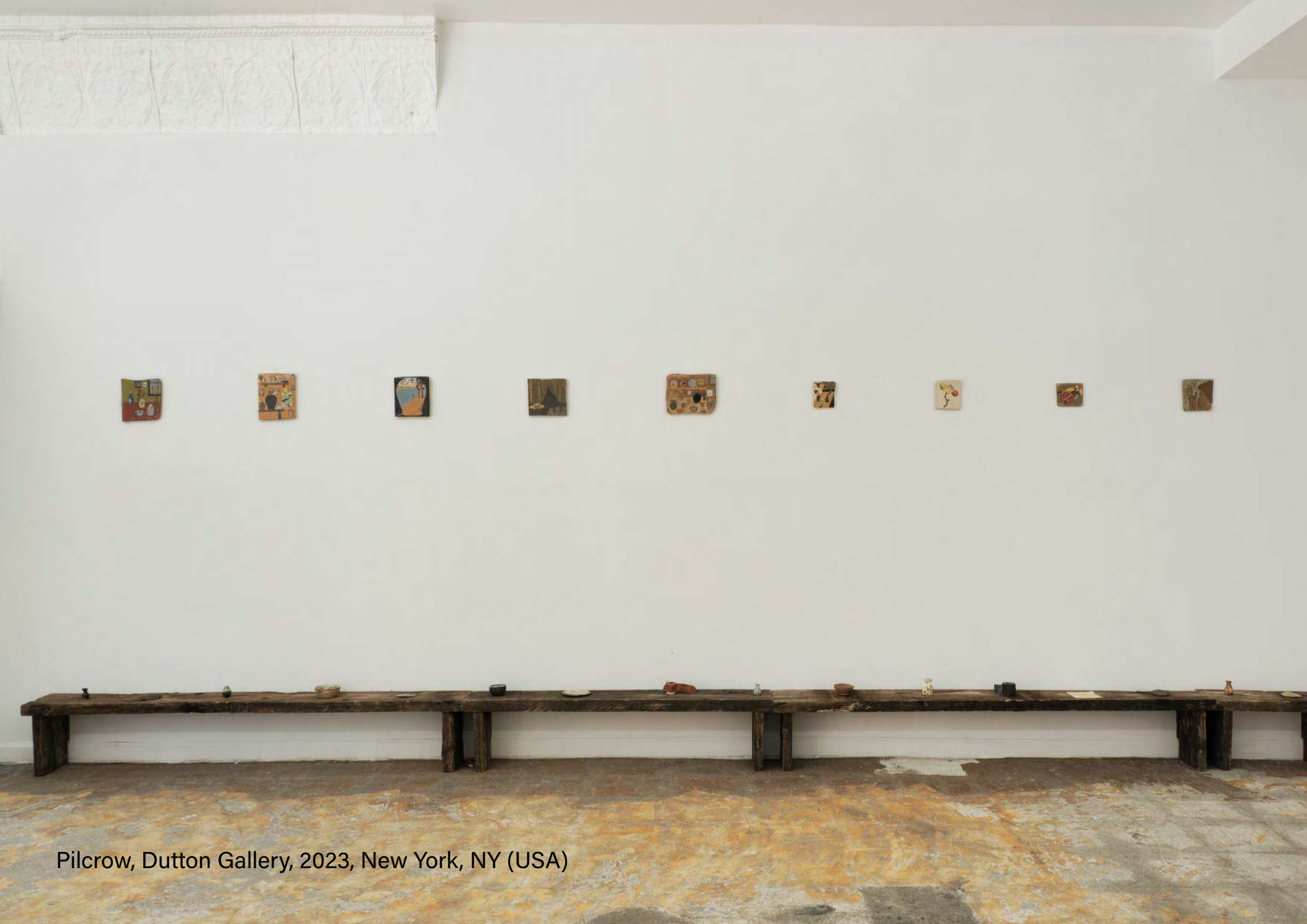
Pilcrow, Dutton Gallery, 2023, New York, NY (USA)