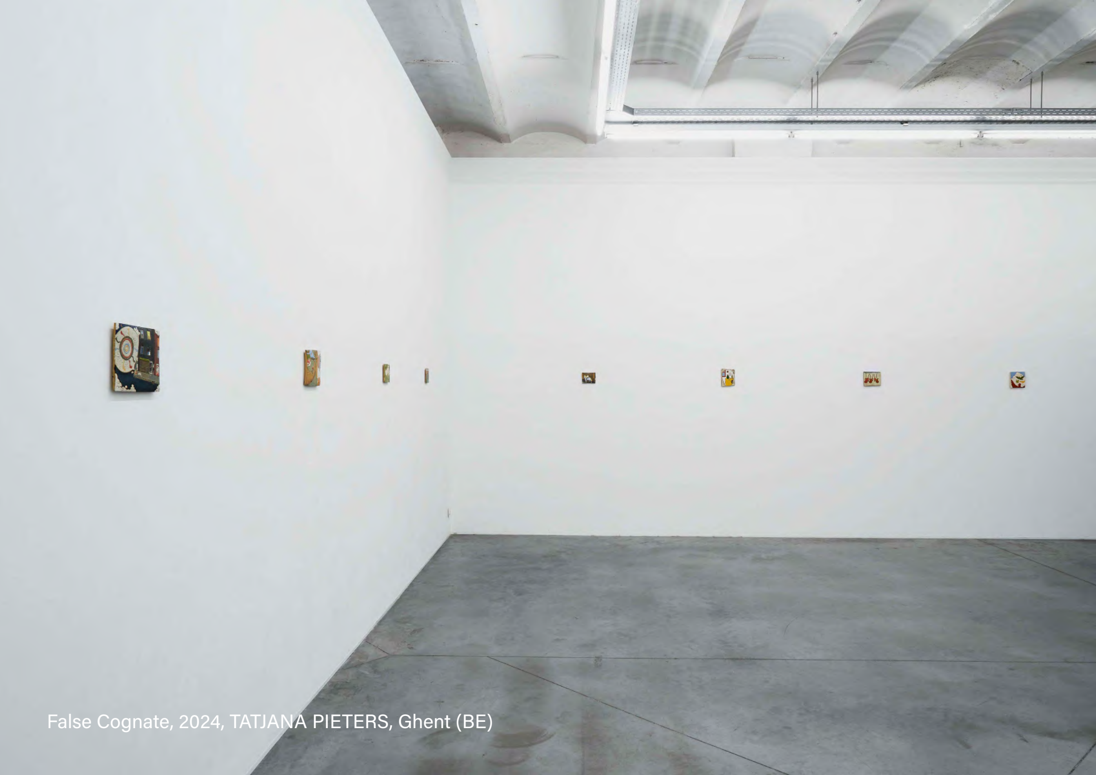
False Cognate, 2024, TATJANA PIETERS, Ghent (BE)