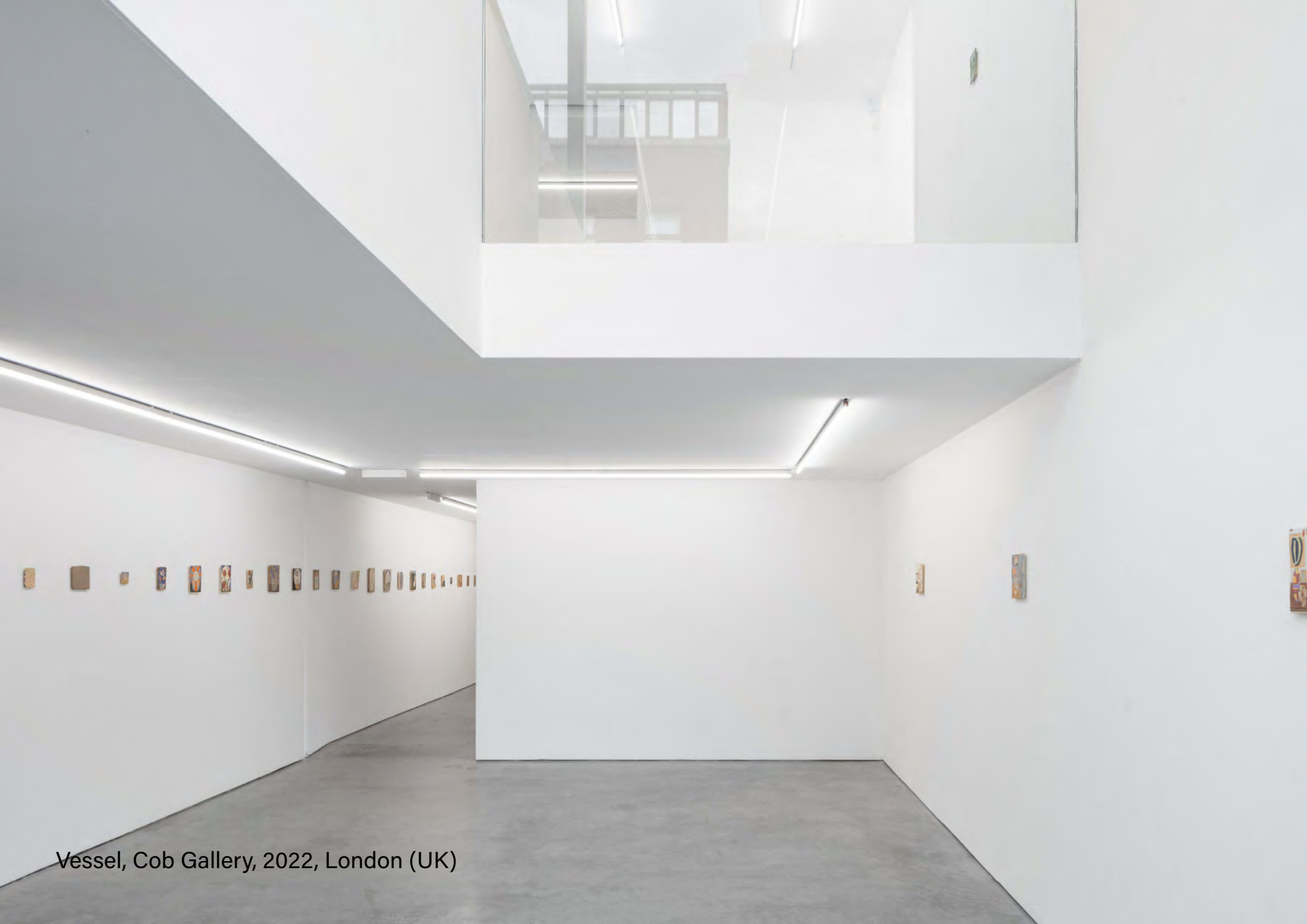
Vessel, Cob Gallery, 2022, London (UK)