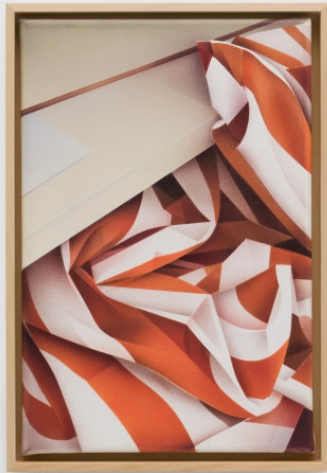
Alexandra Barth Red Striped Curtain, 2024 Acrylic on Canvas 11 3/4 x 7 7/8 inches 30 x 20 cm (AB_o67)