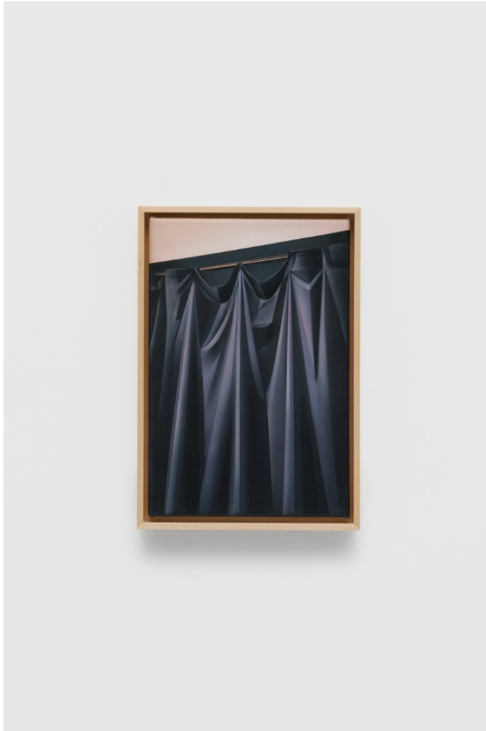
Alexandra Barth Ultramarine Curtain , 2024 Acrylic on Canvas 11 3/4 x 7 7/8 inches 30 x 20 cm (AB_o66)