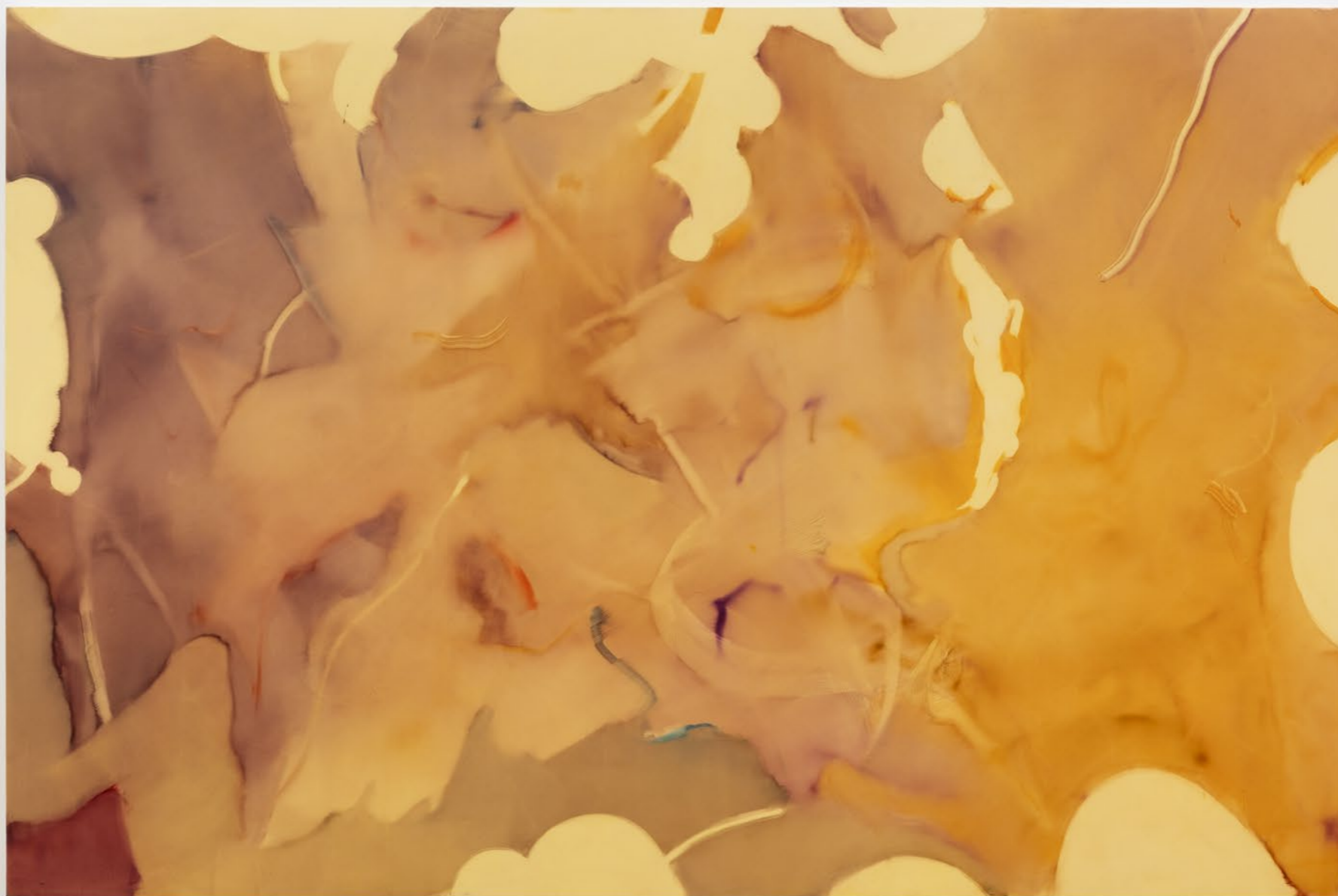
José Díaz Mesetario #1 , 2024 Oil on linen 200 x 300 cm