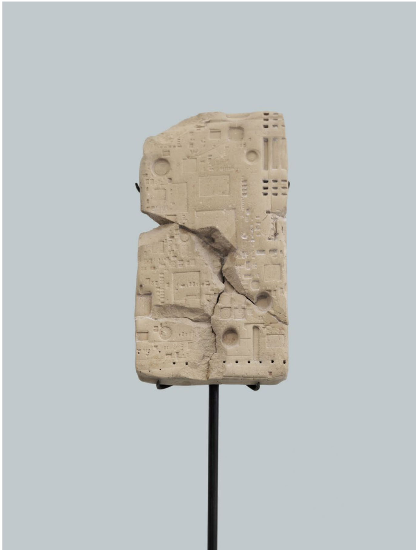
Nicolás Lamas Letters to the Future , 2021 Clay, iron, museum glass case 11,2 x 6 x 1,7 cm (33 x 21 x 23 cm case)