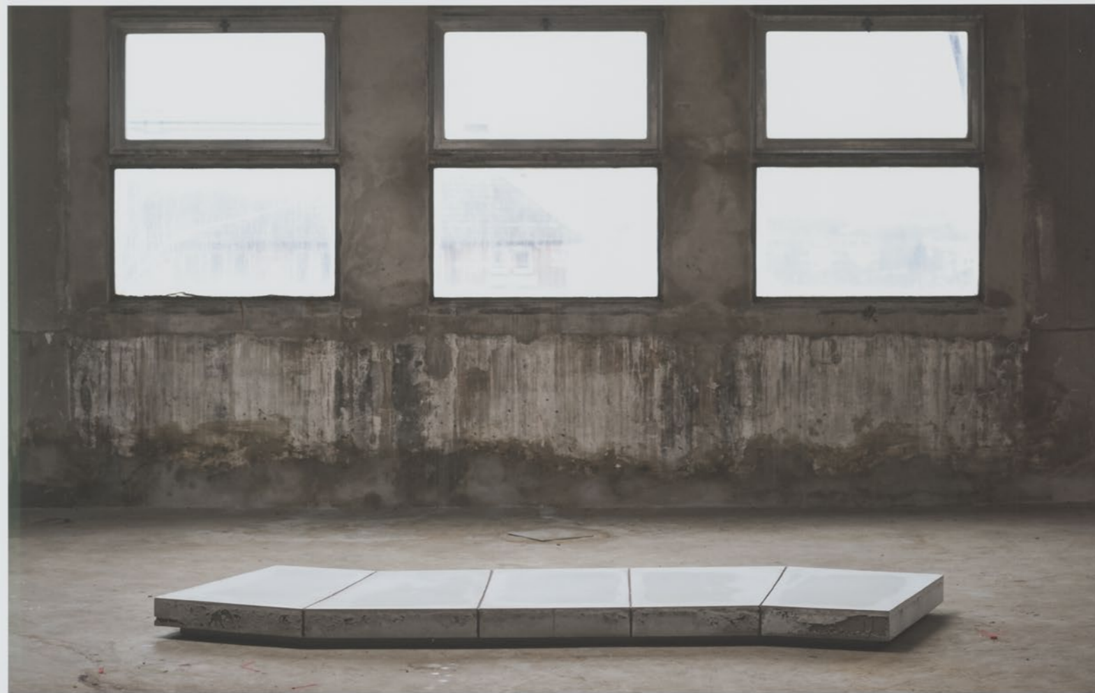
SCULPTURE FOR GLEISDREIECK DECEMBER 12TH, 2017 TEILESTRASSE 11-16 12099 BERLIN