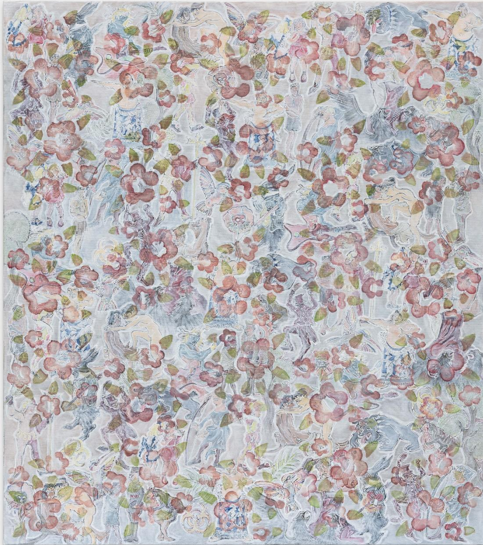
Daniel Moldoveanu, Untitled Wallpaper (pink and green) , 2024

Acrylic, correction pen, white marker on canvas