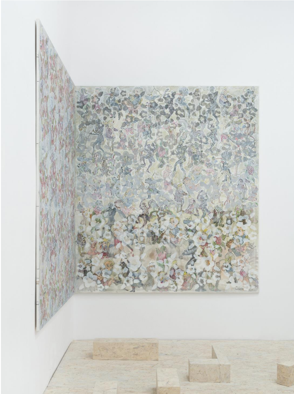
Daniel Moldoveanu, Untitled Wallpaper (white, gray, shades of gray) , Installation view, 2024, Invitro, Bucharest.