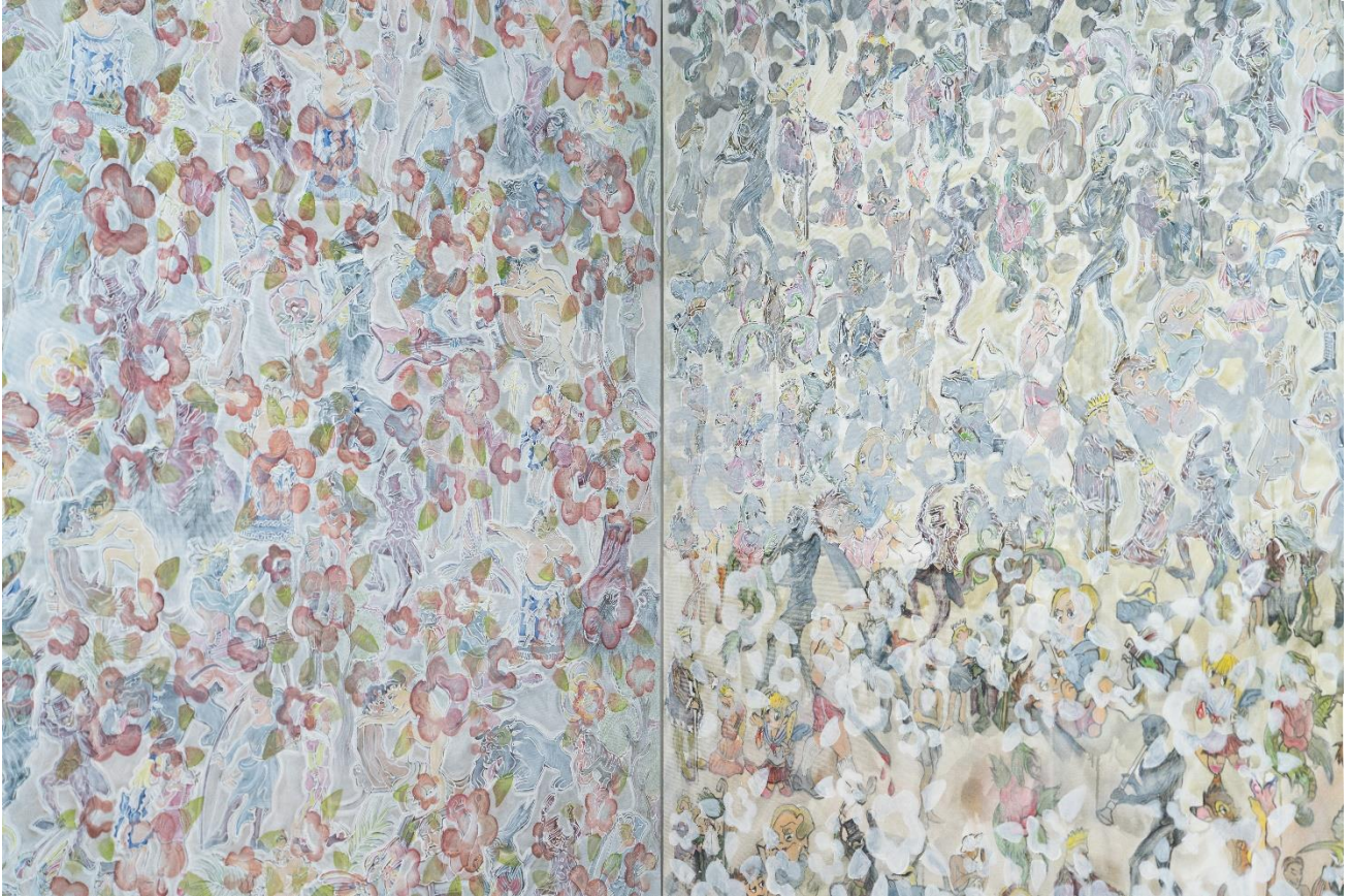
Daniel Moldoveanu, Rude Awakening , Installation view (Detail), 2024, Invitro, Bucharest. Documentation: Nastase Razvan