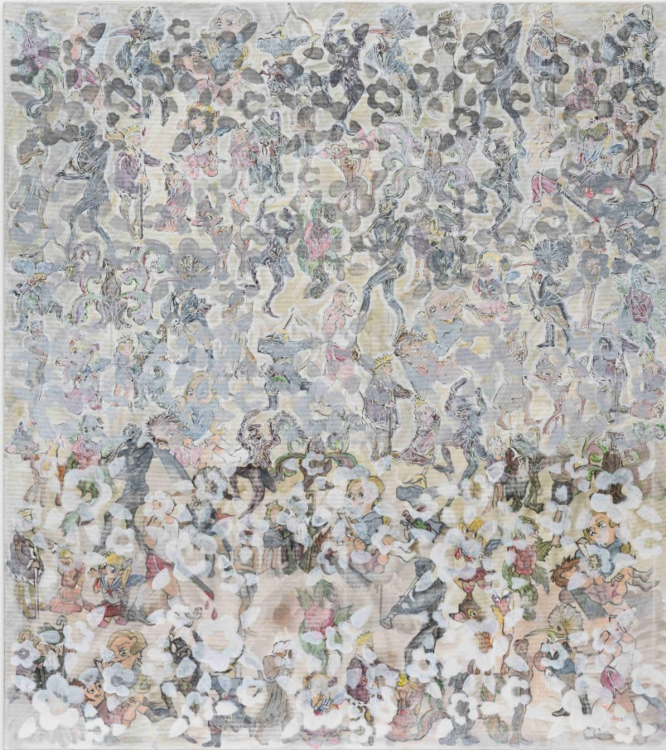
Daniel Moldoveanu, Untitled Wallpaper (white, grey, darker grey) , 2024

Acrylic, correction pen, white marker on canvas.