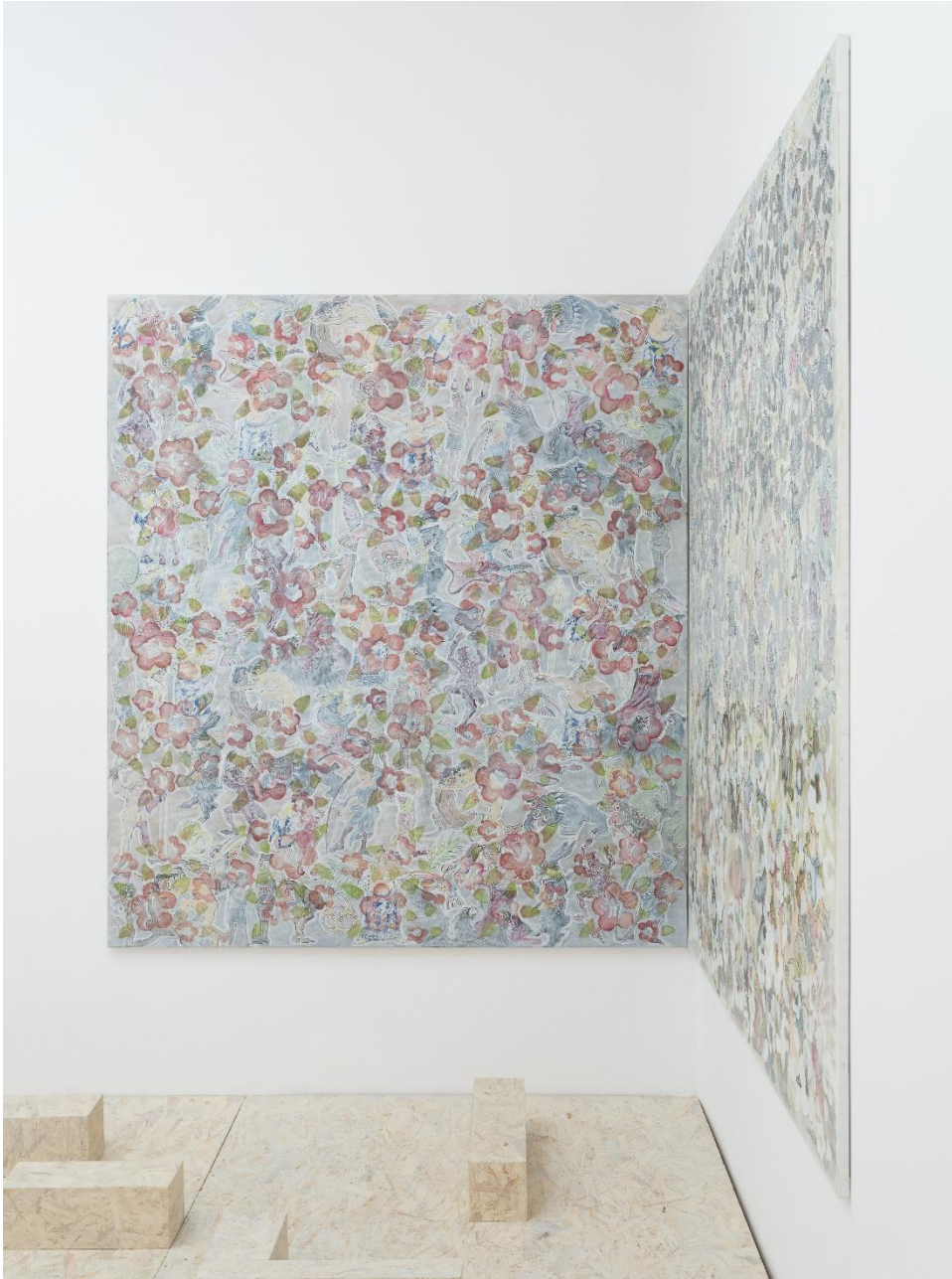
Daniel Moldoveanu, Untitled Wallpaper (pink and green) , 2024, Invitro, Bucharest.