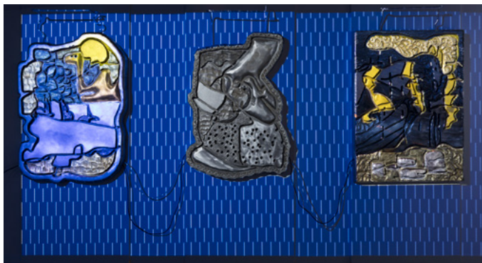
La morale de l'histoire , 2019 (detail) Mixed media installation, variable dimensions Installation view, François Ghebaly, Los Angeles, 2019 Courtesy the artist, François Ghebaly, Los Angeles, kamel mennour, Paris/London, Mendes Wood DM, and ZERO..., Milan Photo: Andrea Rossetti

set that Beloufa built for an actual movie that he was planning to shoot in April 2020.