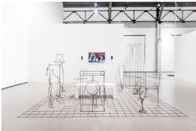
Data for Desire ( Rationalized room series ), 2015 Mixed media installation; video Data for Desire , 2015, 48' (Courtesy Bad Manner's, Paris/Miami/ Ibiza) Installation view, YARAT Contemporary Art Space, Baku, 2015 Courtesy the artist and ZERO..., Milan

On the monitor, a group of youngsters is seen at a garden party in Banff, Canada. In the style of the most popular reality TV shows, Neil Beloufa interviews six of them, who turn out to be the unsuspecting subjects of a socio-mathematical study being carried out simultaneously in France. Indeed, the screen shows a group of French students using the images on camera to analyze the behavior of the youngsters at the party, with the aim of developing an algorithm able to predict the actions and preferences of the Canadian peers. However, the experiment will not be successful, showing the impossibility to determine certain social balances a priori and on the basis of stereotypes, especially with regard to feelings. To increase spontaneity, Beloufa did not give the actors a script, who were thus able to choose which role to play.