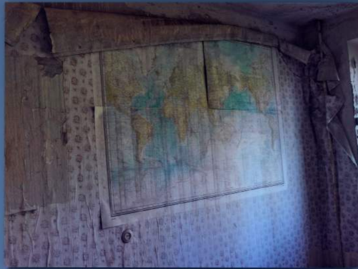
Field note 09-05-16—2 (Worldmap, Pripjat, Chernobyl) , 2016. From the series 'From the Pit of Et Cetera' In collaboration with Roberto Rubalcava Diasec framed C-print 120 x 160 cm Edition of 3 + 2 AP