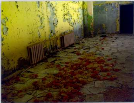
Field note 10-05-16—1 (Basin, Pripyat, Chernobyl), 2017. From the series 'From the Pit of Et Cetera'. In collaboration with Roberto Rubalcava and Peter Miles Diasec framed C-print 60 × 80 cm Edition of 5 + 2 AP