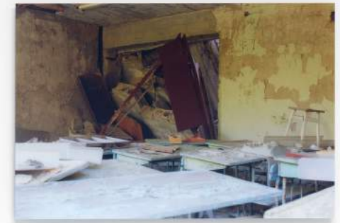
Field note 10-05-16—3 (School, Pripyat, Chernobyl), 2017. From the series 'From the Pit of Et Cetera'. In collaboration with Roberto Rubalcava and Peter Miles Diasec framed C-print 60 × 80 cm Edition of 5 + 2 AP