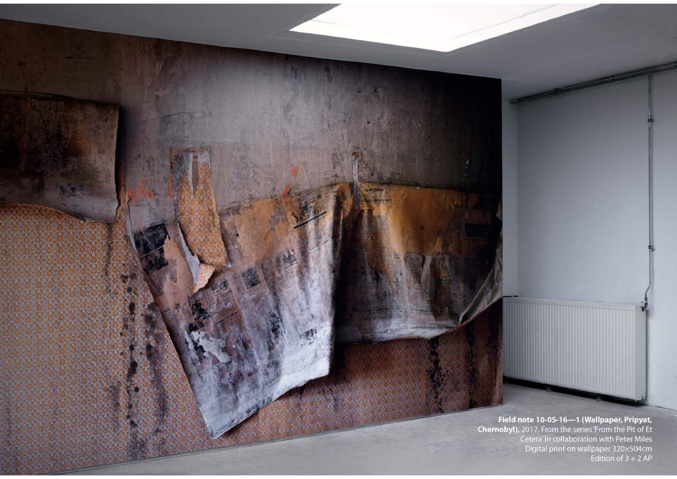
Field note 10-05-16—1 (Wallpaper, Pripjat, Chernobyl) , 2017. From the series 'From the Pit of Et Cetera' In collaboration with Peter Miles Digital print on wallpaper 320x504cm Edition of 3 + 2 AP