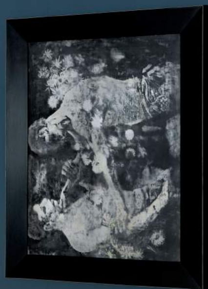
Still life with meadow flowers and roses (after Vincent van Gogh), 2016. From the series 'From the Pit of Et Cetera' Mixed media on wood 122 x 102 x 4 cm Unique piece, version 2 of 3