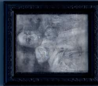
Four Figures at a Table (after The Le Nain Brothers) , 2016. From the series 'From the Pit of Et Cetera' Mixed media on wood 74×64×8.5cm Unique piece, version 2 of 3