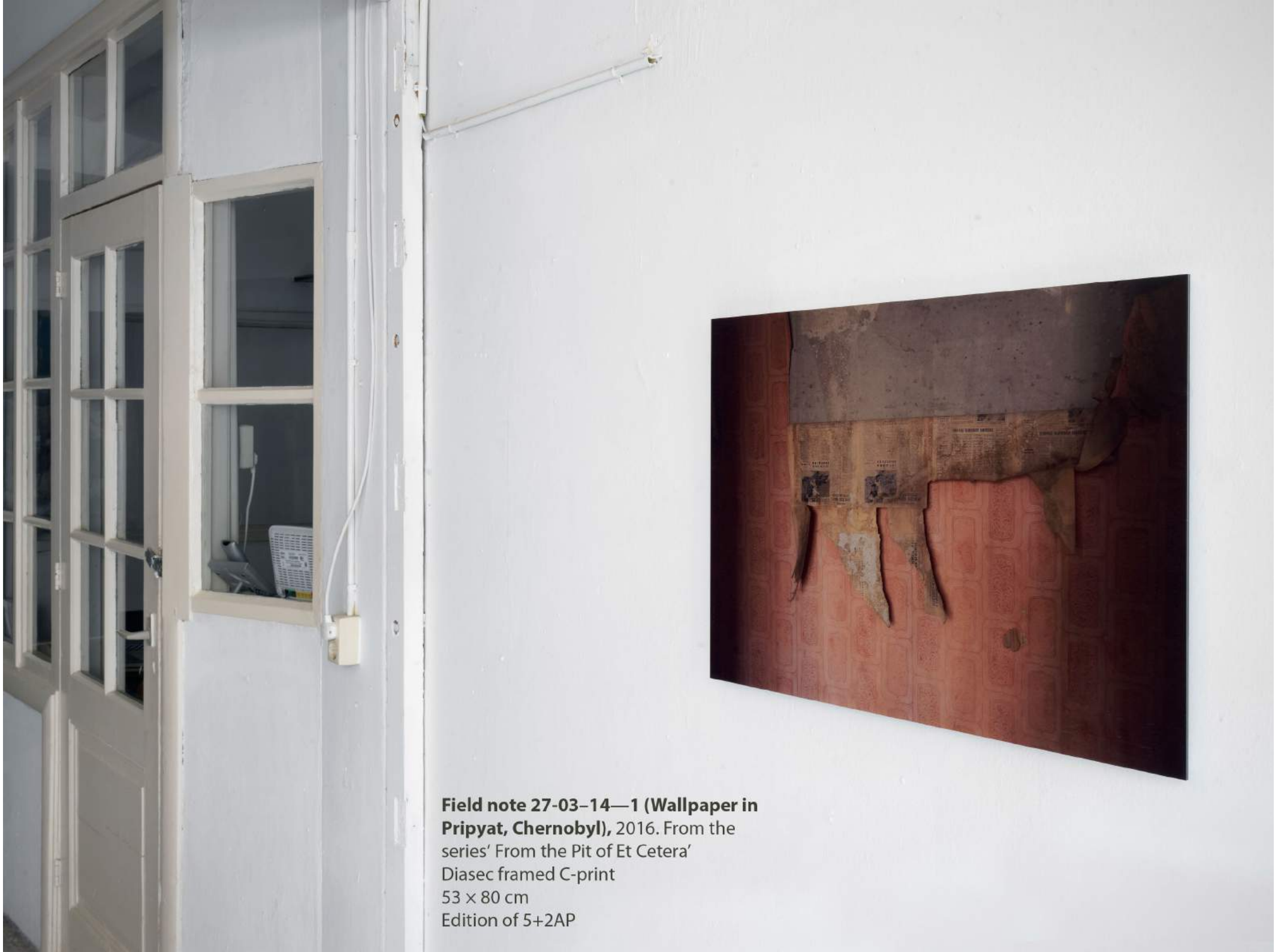
Field note 27-03-14—1 (Wallpaper in Pripjat, Chernobyl) , 2016. From the series 'From the Pit of Et Cetera' Diasc framed C-print 53 × 80 cm Edition of 5+2AP