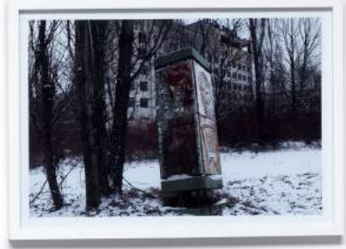
Field note 26-01-15—1/6 (Billboards, Pripyat, Chernobyl), 2017. From the series 'From the Pit of Et Cetera' In collaboration with Roberto Rubalcava Series of six framed C-prints 36 x 51 cm each Edition of 3 + 2AP