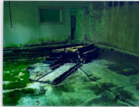
Field note 10-05-16—2 (Music School, Pripyat, Chernobyl), 2017. From the series 'From the Pit of Et Cetera'. In collaboration with Roberto Rubalcava and Peter Miles Diasec framed C-print 60 × 80 cm Edition of 5 + 2 AP